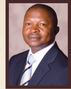
Hon. DD Mabuza Premier